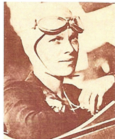
Amelia Earhart THE FUN OF IT